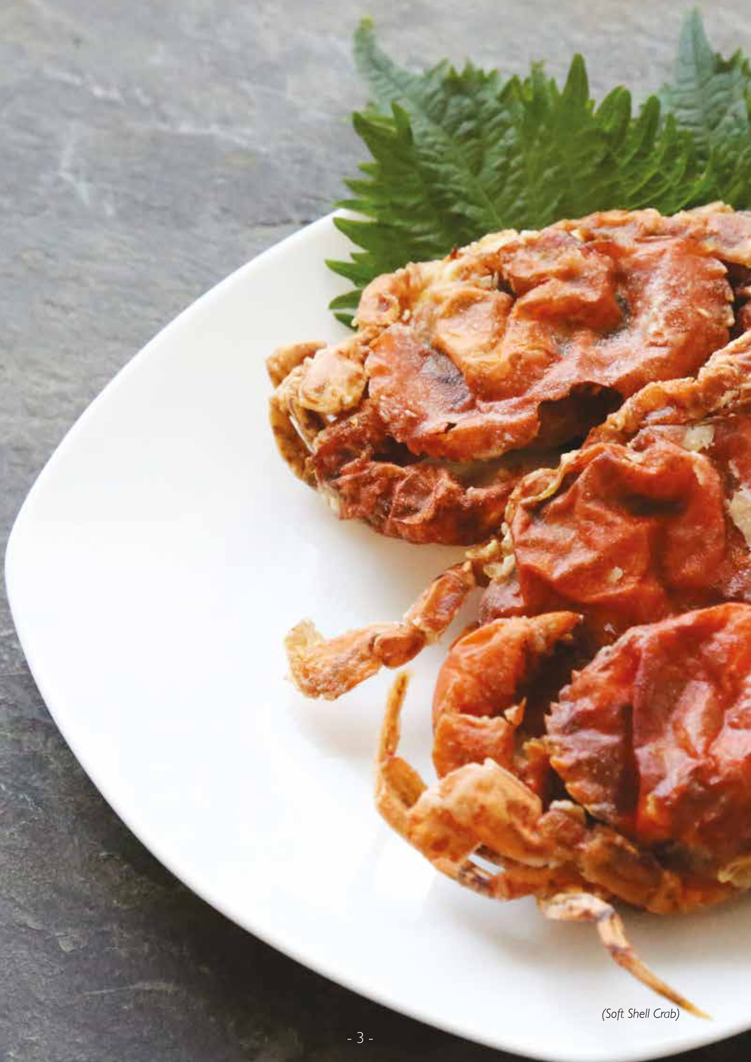
(Soft Shell Crab)